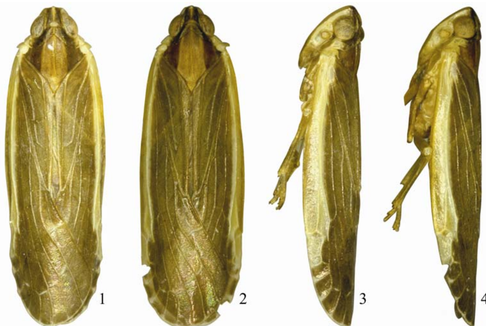
Figures 1–4. Semibetatropis patungkuanensis Chen, Yang & Wilson, 1989. 1. Male habitus, dorsal view; 2. Female habitus, dorsal view; 3. Male habitus, lateral view; 4. Female habitus, lateral view.

the middle of base; right lateral produced in a subtriangular process. Phallobase in ventral view (Fig. 15), apical margin of ventral lobe serrated, ventrad rising and concave in the middle; apical margin on left side basad extending to the subapical, thence projecting outwards; left lateral margin with a process produced outwards in the middle, thence to base crookedly serrated; right lateral margin with a process produced outwards near apex; right surface near the middle with a longitudinal serrated band. Each phallic appendage with a corner near apex, beneath left apex of phallic appendage with two spines (one big and one small), and the right apex with only one big spine (Fig. 16).