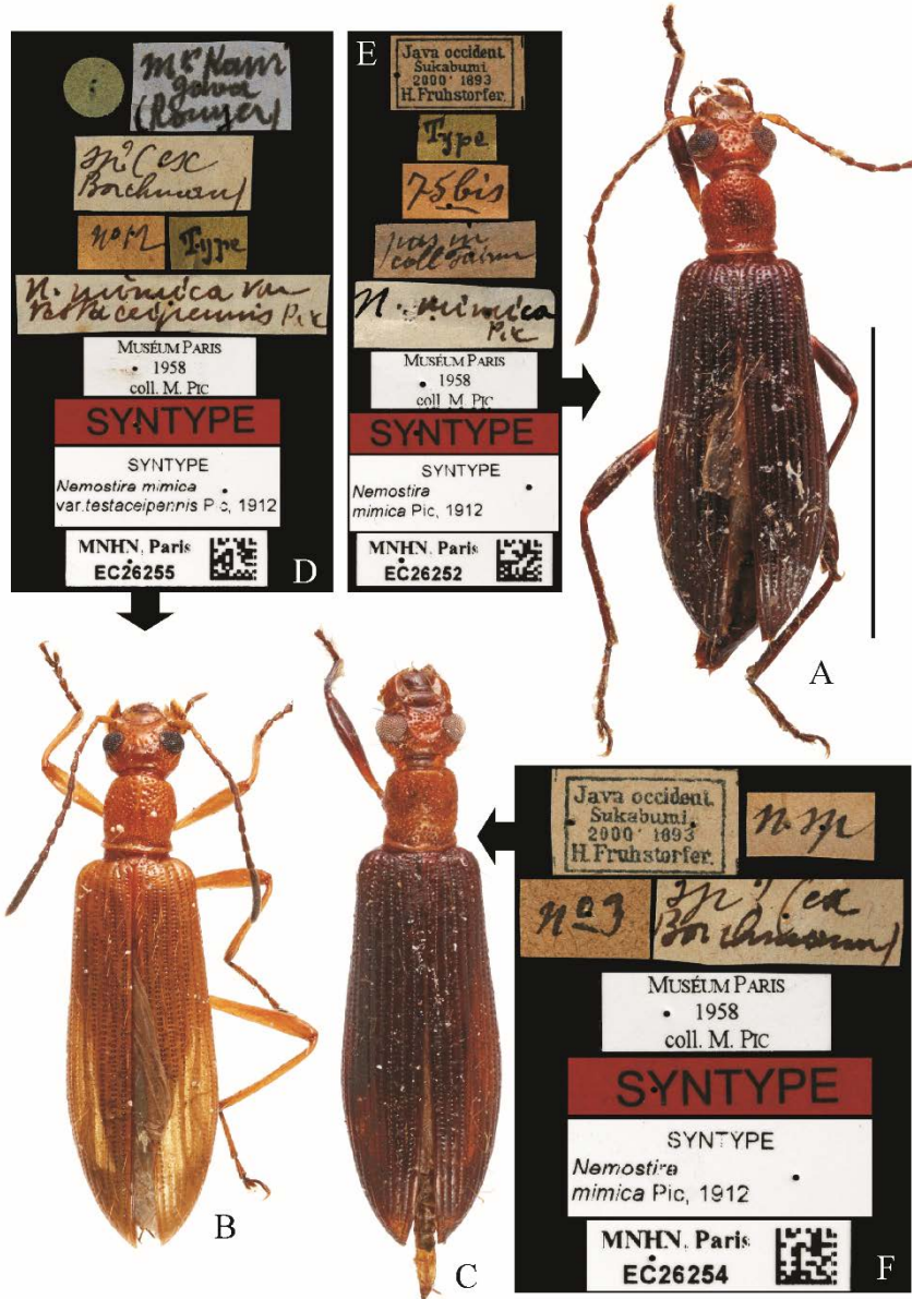
Figure 2. A–C. Type specimen. A. Sora mimica (Pic, 1912), female; B. Sora mimica var. testaceipennis (Pic, 1912), female; C. Sora mimica (Pic, 1912), female; D–F. Labels of type specimens. Scale bar = 4 mm (A–C).

Diagnosis. Body small, head obviously broader than pronotum; antennomere I depressed, oval, broadest at the middle (unlike most congeneric species, antennomere I broadest before apex).